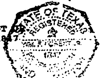
EXHIBIT 'B' Page 3 of 3